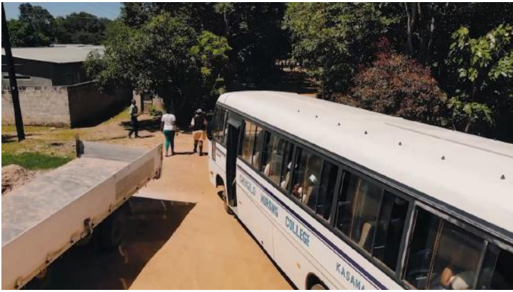
Figure 3 Chengelo School of Nursing in Kasama district is a proudly empowered by CEEC to provide high quality Registered Nursing education for the attainment of the Zambian community having access to quality health care.