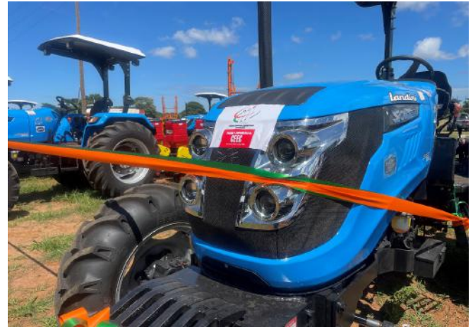
Figure 2 Part of the equipment handed over including ten tractor sets with planters, boom sprayers, dick tray, disk harrow, plough and shellers.

In an inspiring handover ceremony, the Citizens Economic Empowerment Commission (CEEC) handed over farming equipment to successful applicant under the agricultural mechanisation loan product.