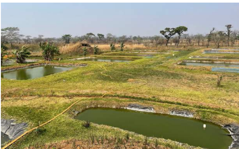
Figure 3 Kisalala's eight (8) breeding ponds that are as a result of CEEC's increased support to aquaculture clients in Northwestern Province.

In this regard, the ripple effect of citizen empowerment through CEEC is a key driver of progress and prosperity in Zambia, benefitting all economic sector players and fostering sustainable development.