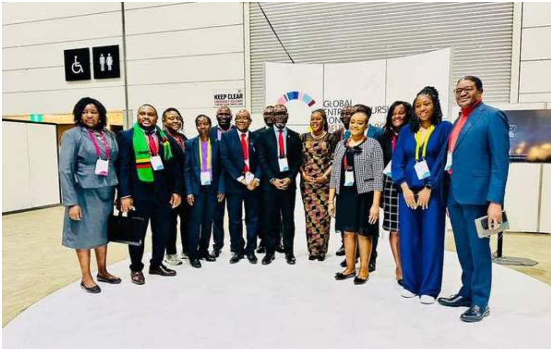
Figure 4 The Zambia delegation at GEC 2023 that took place in Australia.